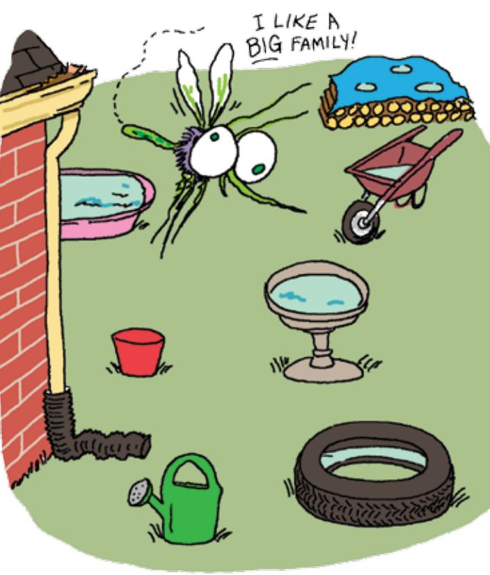
Empty watering cans, children's buckets, etc.