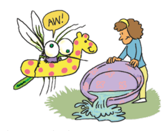
Drain unused swimming pools. Empty wading pools at least weekly.