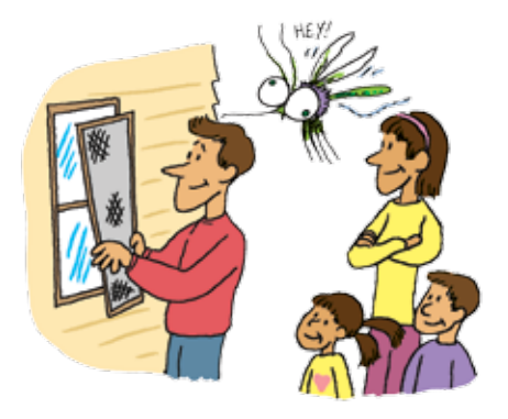
Make sure door and window screens fit tightly and all holes repaired.