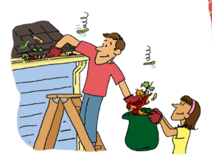
Clean leaves and debris from roof gutters, downspouts, and elephant trunk extensions.