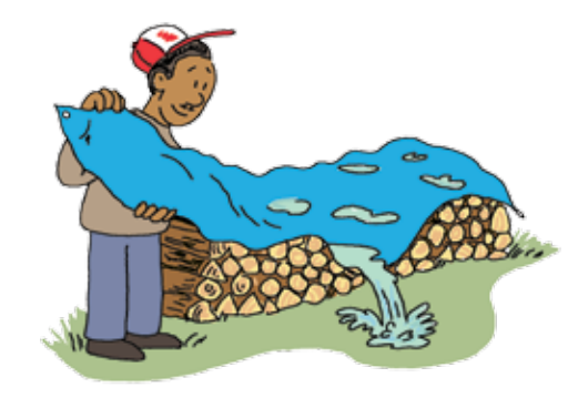
Empty water that collects in folds of tarps.