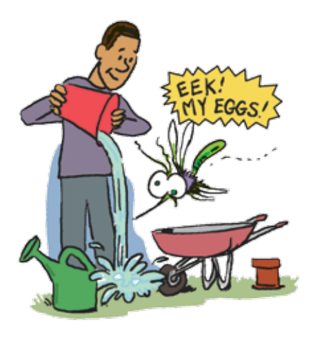
Empty buckets, drums, or water-holding containers.